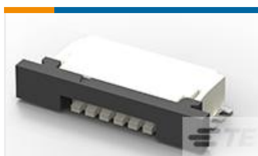
TE Part # 1735265-5 1MM FPC HORZ.BOTTOM CONT. ASSY 5P (Au)