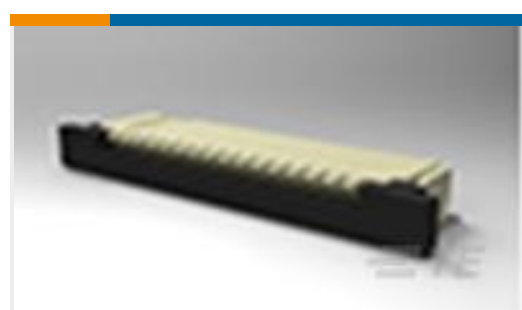
TE Part # 84953-5 1MM FPC HORZ.TOP CONT.ASSY 5P